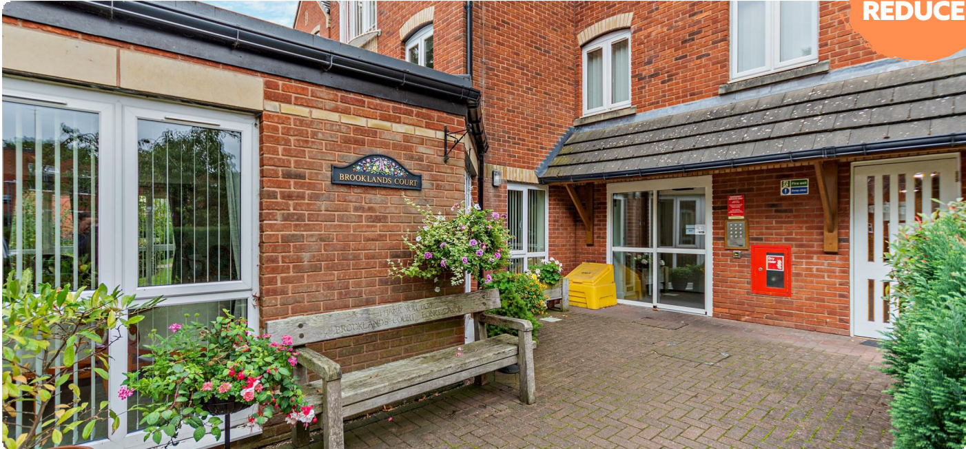
Brooklands Court, Tamworth Road Long Eaton, Nottingham Approximate Gross Internal Area 541 Sq Ft/50 Sq M